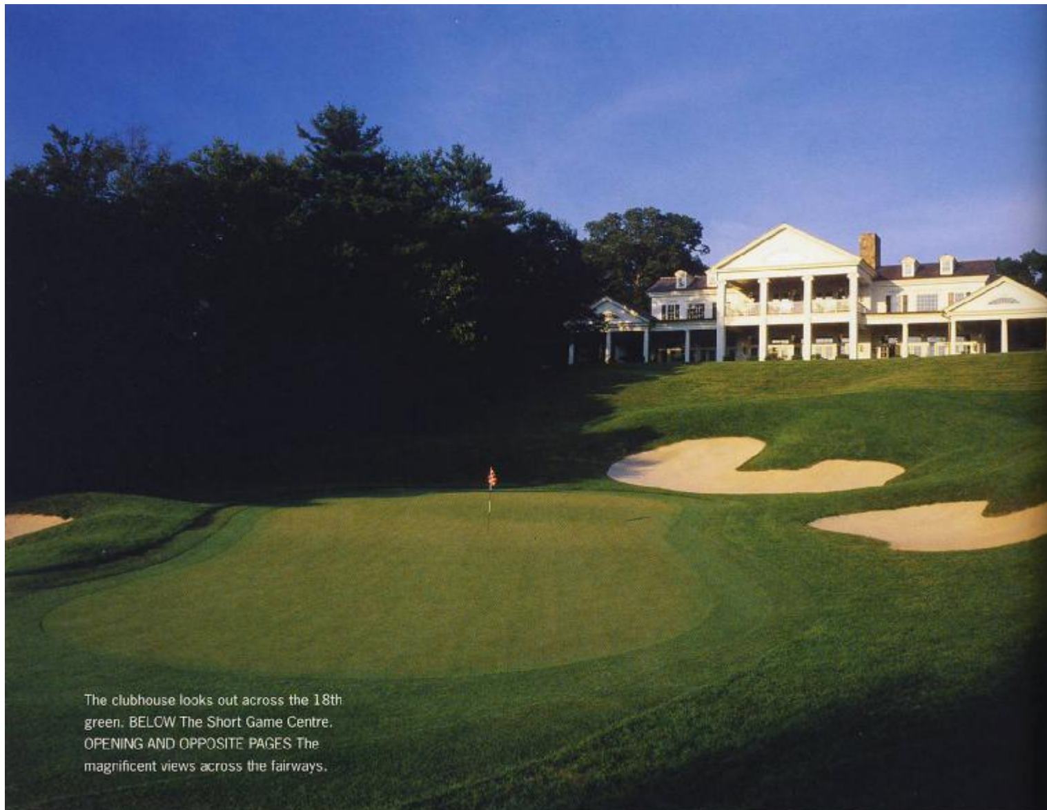
The clubhouse looks out across the 18th green. BELOW The Short Game Centre. OPENING AND OPPOSITE PAGES The magnificent views across the fairways.