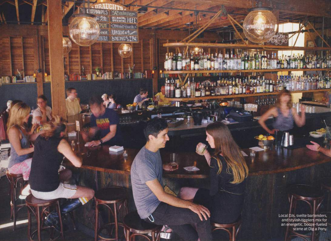
Local DJs, svelte bartenders, and stylish tipplers mix for an energetic, booze-fueled scene at Dig a Pony.