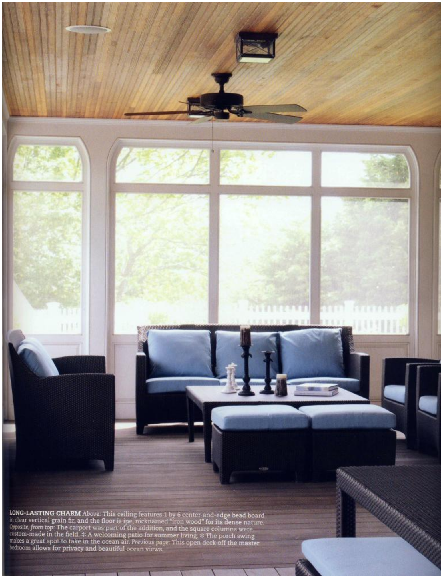
LONG-LASTING CHARM Above: This ceiling features 1 by 6 center-and-edge bead board in clear vertical grain fir, and the floor is ipe, nicknamed "iron wood" for its dense nature. Opposite, from top: The carport was part of the addition, and the square columns were custom-made in the field. * A welcoming patio for summer living. * The porch swing makes a great spot to take in the ocean air. Previous page: This open deck off the master bedroom allows for privacy and beautiful ocean views.