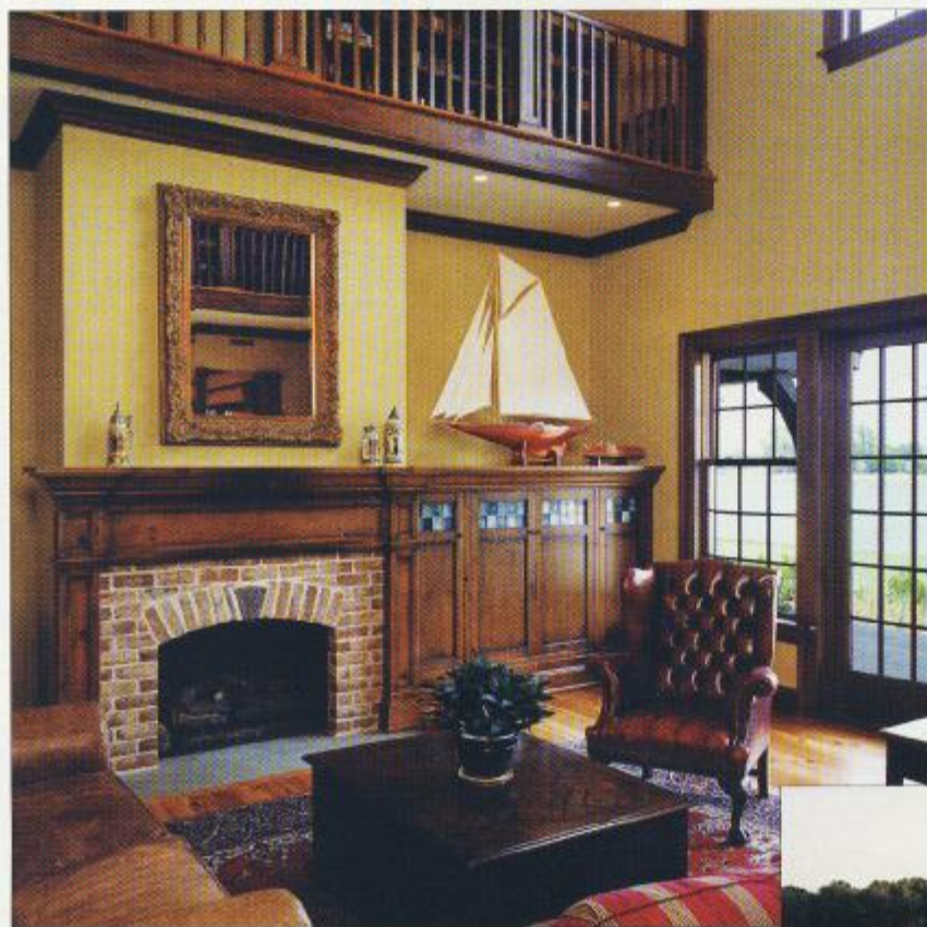
Left: Living room in the first of six planned golf cottages at Briar's Creek. Below: Expansive marshlands along the Briar's Creek golf course.

Exclusive private play in South Carolina's Lowcountry