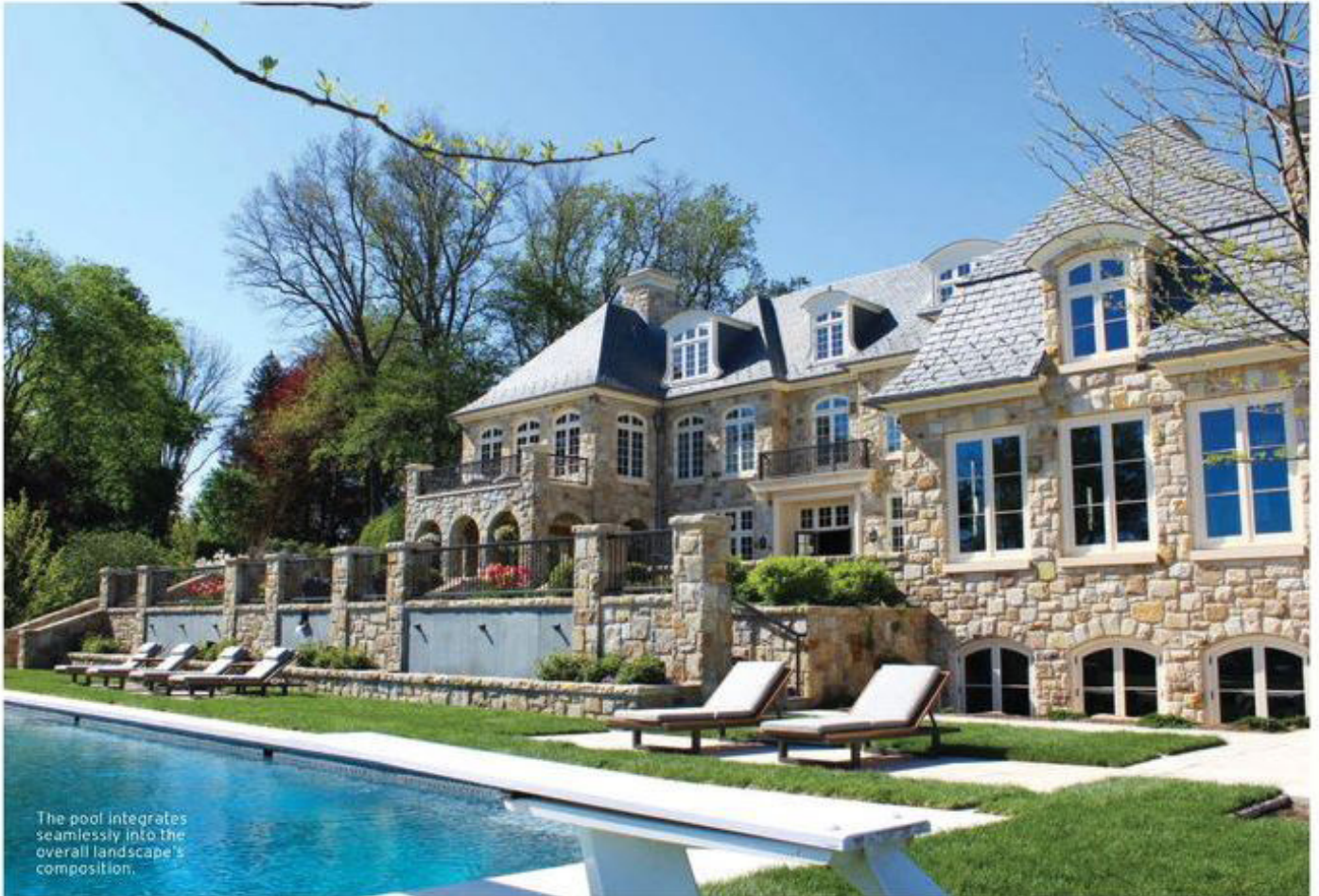
The pool integrates seamlessly into the overall landscape's composition.

“This project was a true realization of our clients’ specific vision. The owners had a definite and distinct style. In the end, this home is perfectly tailored for the lot and fully capitalizes on the gorgeous scenes of Long Island Sound.”